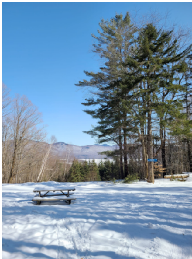
One of many great views at Mountain Top Resort, Chittenden, Vermont.

Miramar is a friendly club; although mainly an alpine club, they can accommodate XC skiers as well. It was an enjoyable, all-inclusive weekend (trail passes extra). I even enticed a few to join LICCSC!