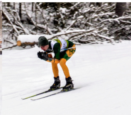
Scene from the juniors race