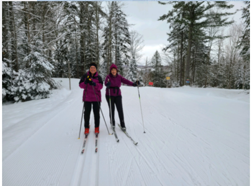
Scenes from Craftsbury