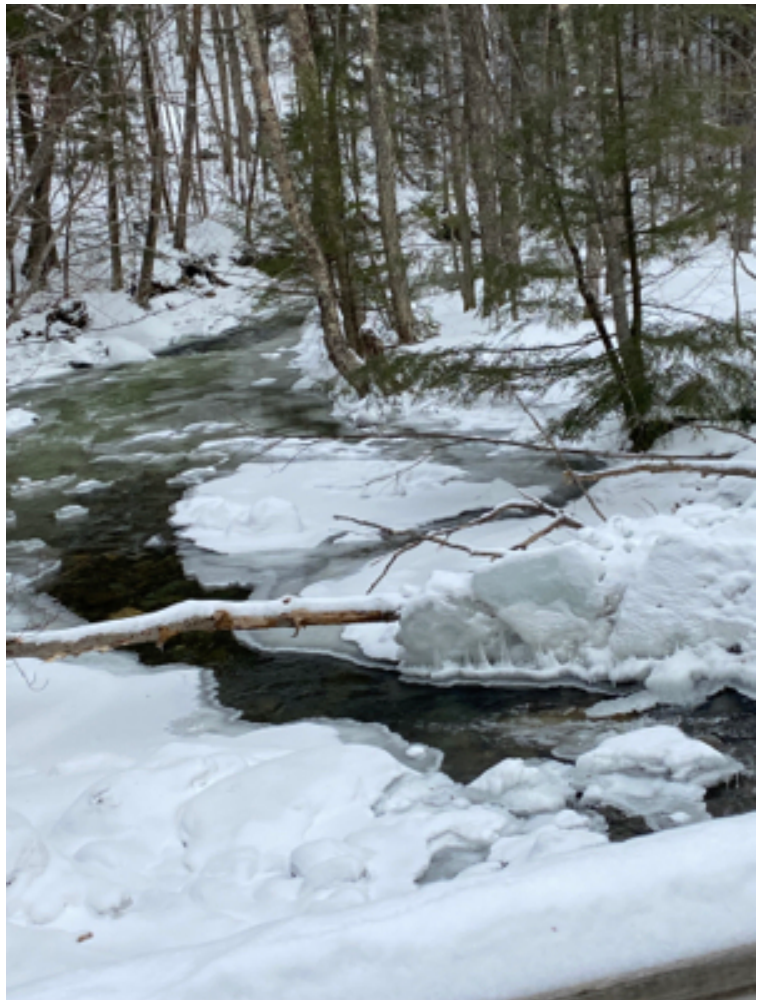
Somewhere in beautiful Vermont...on the Miramar trip.

Speaking of trips, the Craftsbury Jan-Feb 2023 trip is sold out. This is the trip run by Road Scholar that our club members sign up for; some of us don't do the RS thing but the week we picked is especially fun, as it has music and dance (other trips have yoga or other activities). If you're interested in the music and dance week for the following year (Jan-Feb 2024), keep a eye on the Road Scholar website