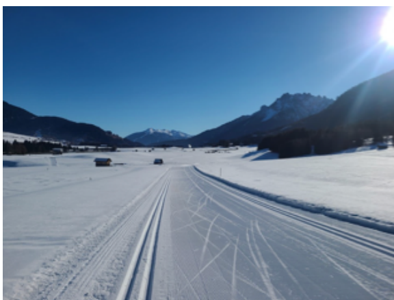
Skiing to Villa Basso

The scenery never disappointed. Let me know if you have a hankering for ski destinations afar!