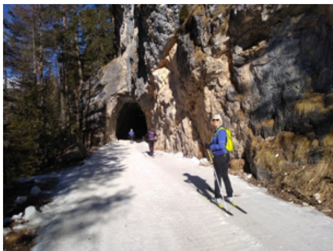
Outside Fiammes, Italy, we skied through former railway tunnels hand hewn before World War II.