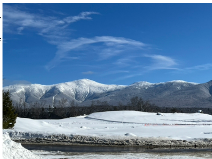
Bretton Woods

I would recommend this trip to all next year!