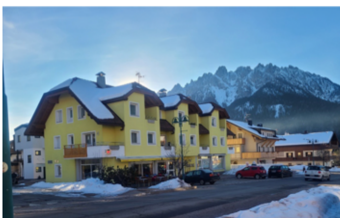
The morning view from our hotel