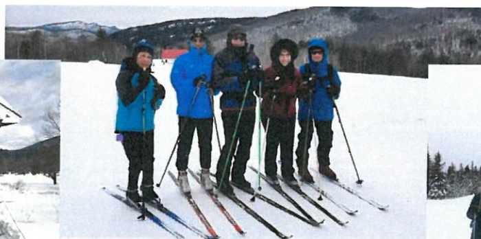
Garnet Hill, NY