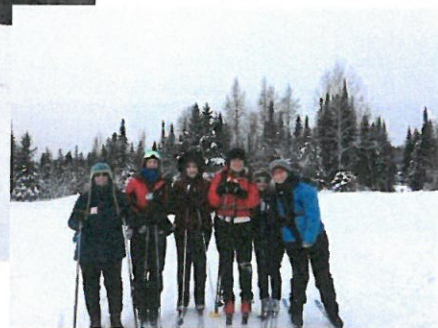
Lake Placid, NY